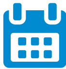
Planning for the future