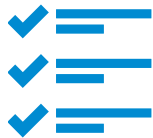
Advocacy and coordination of supports