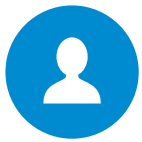
Mentoring and coaching support